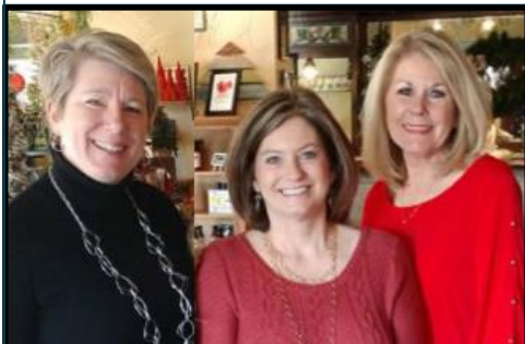
Dunn Area Chamber of Commerce Staff pictured at the Ambassadors Club Christmas Meeting in December 2017